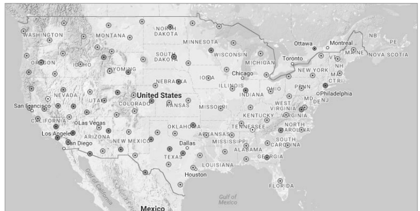
The USGS Reference Station Network forms the backbone of the lower 48 United States seismic array.