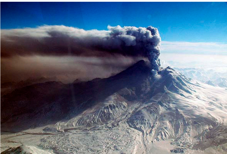
Alaska's Redoubt volcano with minor ash eruption.

March 30, 2009