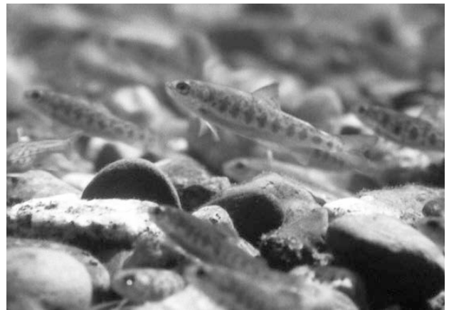
Once the yolk is depleted, the fry emerge from the gravel to look for food, gradually maturing into parr by the end of the summer.