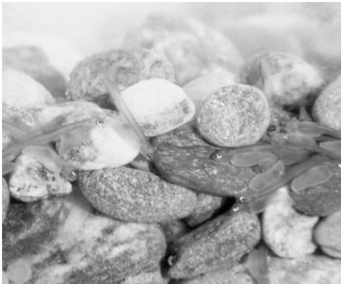
Atlantic salmon sac fry remain in the gravel habitat of their redd until their yolk sac is depleted.