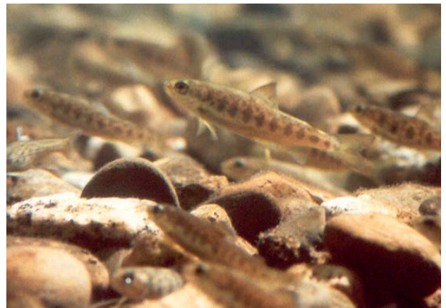
Once the yolk is depleted, the fry emerge from the gravel to look for food, gradually maturing into parr by the end of the summer.