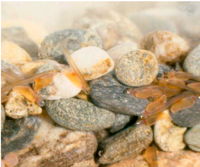
Atlantic salmon sac fry remain in the gravel habitat of their redd until their yolk sac is depleted.