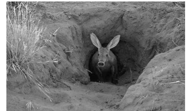
An armadillo emerges from its burrow.