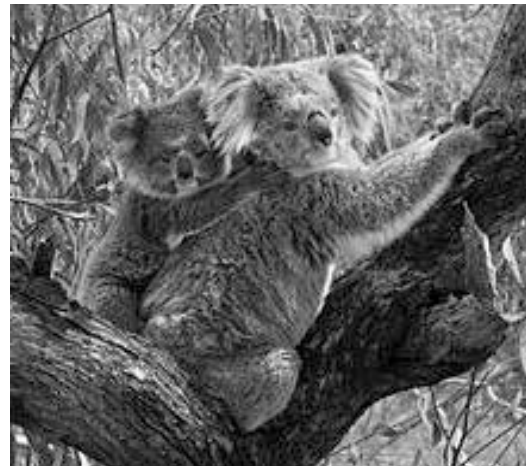
Koala mother with her joey.