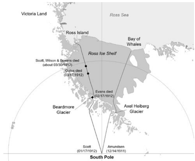
Roald Amundsen's and Robert F. Scott's routes, red and green respectively, to the South Pole.