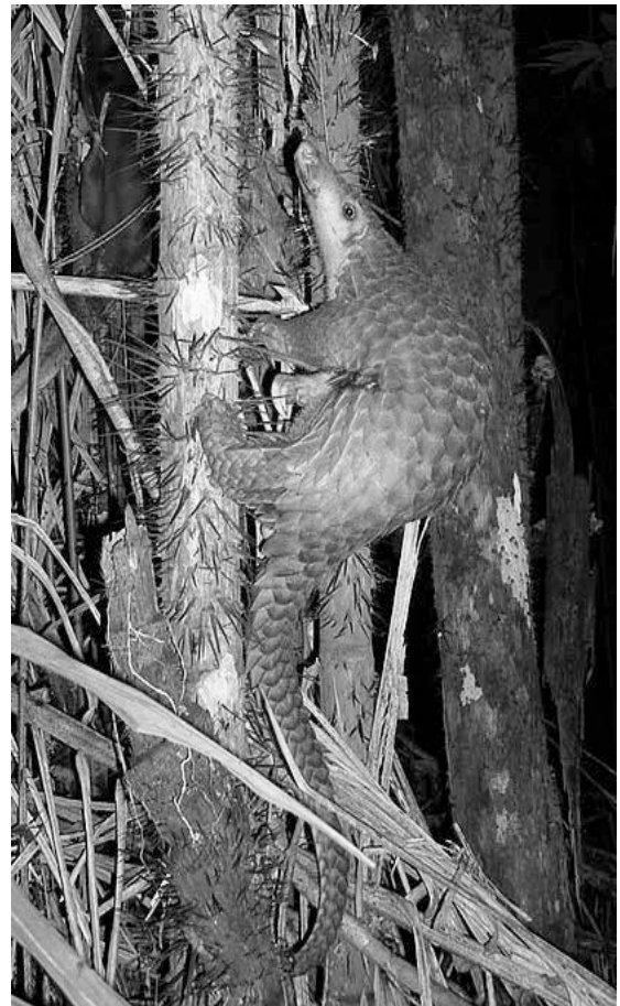
Pangolin, Manis javanica .