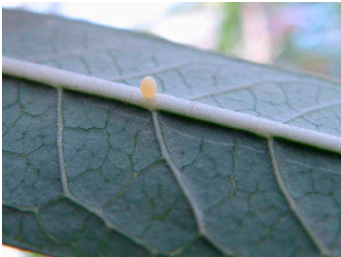
Single monarch egg on the underside of a milkweed leaf.