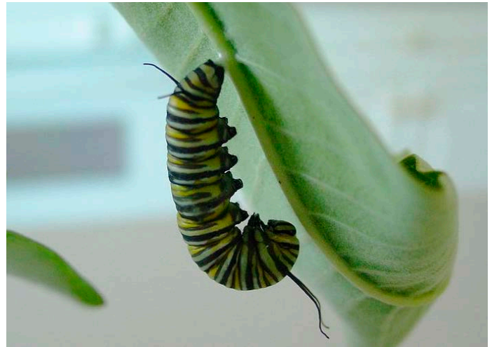
A monarch caterpillar beginning its pupation on the leaf of a Common milkweed plant.