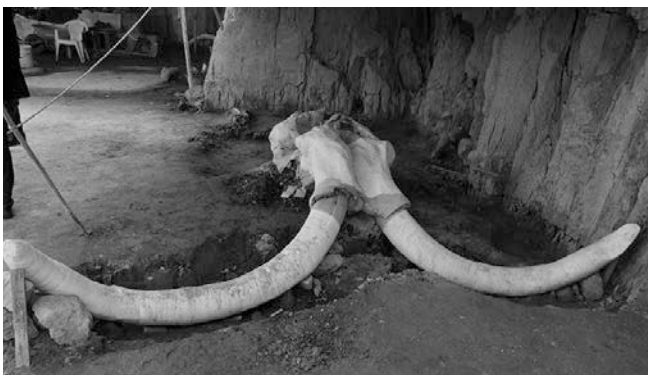
A woolly mammoth skull and tusks.