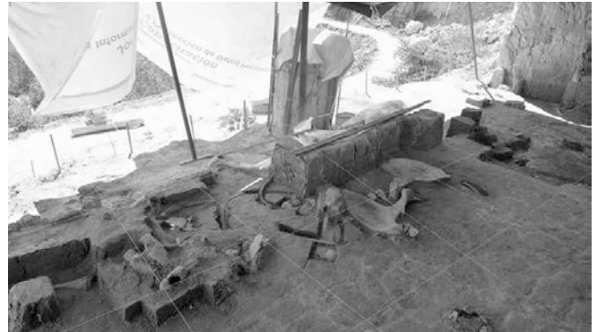
More than 820 bones have been found in the two pits near Tultepec.