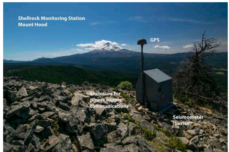
A volcano monitoring station on Oregon's Mount Hood combines an external GPS antenna and buried digital seismometer to sense ground motion and gas emissions.