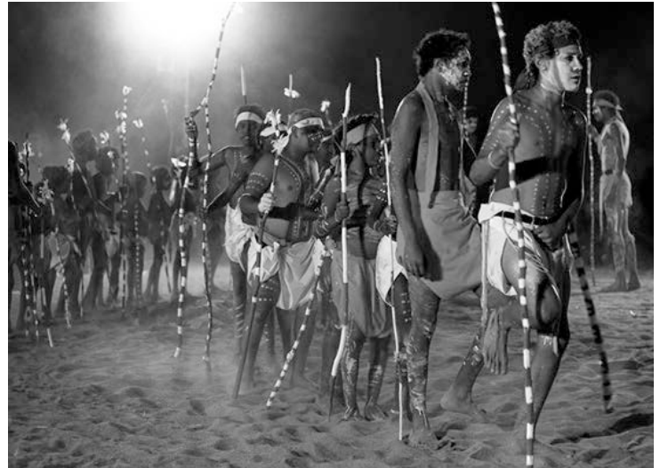
Generations of dancers from the Worrorra community perform a hunting dance at the Mowanjum corroboree. Their bodies are painted with different designs depicting the stories told by the dances they will perform.