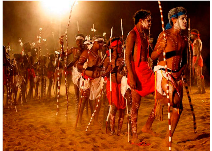
Generations of dancers from the Worrorra community perform a hunting dance at the Mowanjum corroboree. Their bodies are painted with different designs depicting the stories told by the dances they will perform.