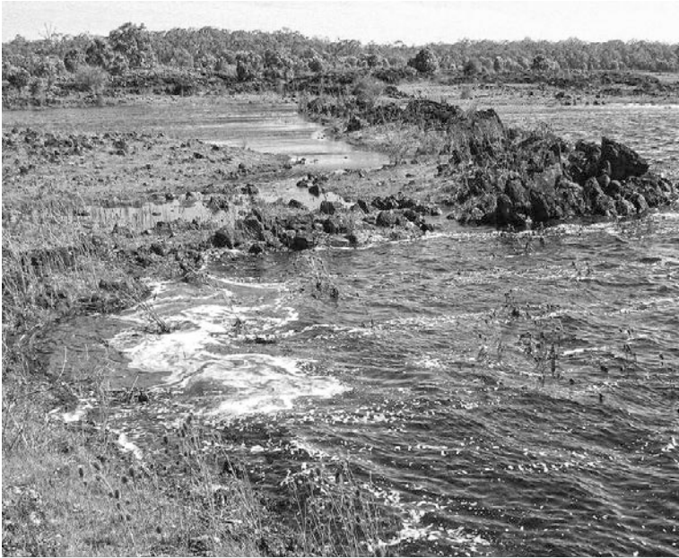
Stone fish traps in Budj Bim Cultural Landscape.