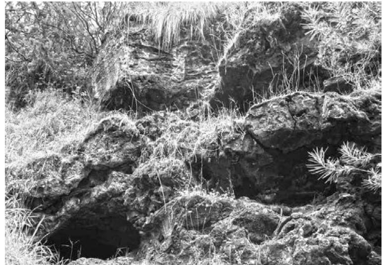
Lava flows produced by Budj Bim as recently as 37,000 years ago.