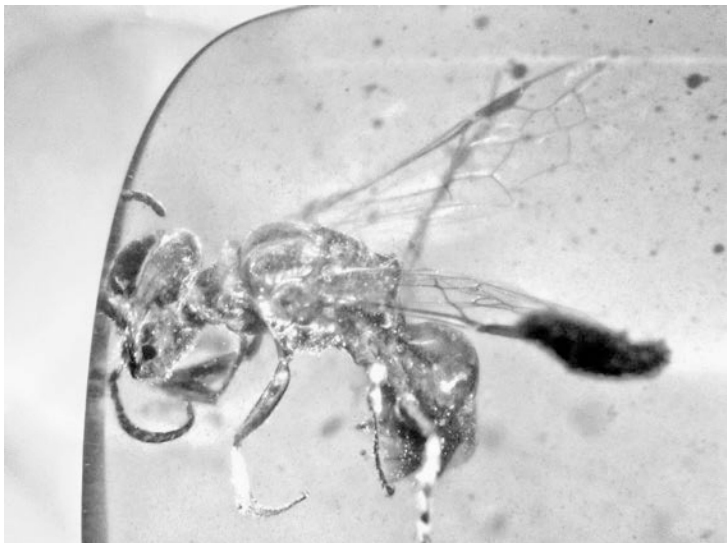
This 100-million-year-old fossilized bee shares traits with both modern bees and apoid wasps.