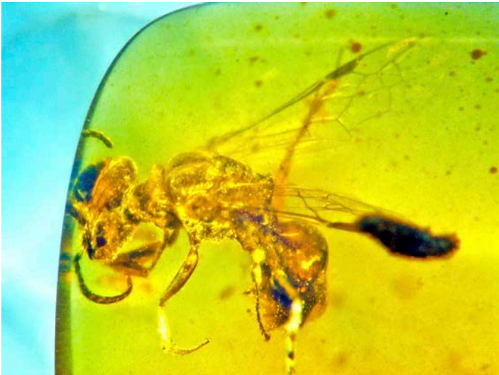
This 100-million-year-old fossilized bee shares traits with both modern bees and apoid wasps.