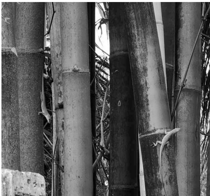
Two green lizards on bamboo in Miami, Florida. On the left is a Madagascar giant day gecko ( Phelsuma grandis ), and on the right is a green anole ( Anolis carolinensis ).