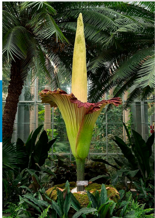
A corpse flower (titan arum) in bloom at the United States Botanic Garden, Washington, DC, in July 2013.

These denizens of the botanical underworld may not smell very good, but their spectacular appearances are a frightfully memorable sight.