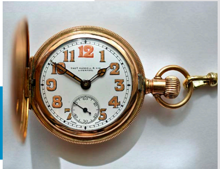
A pocket watch made by Thos. Russell & Son.