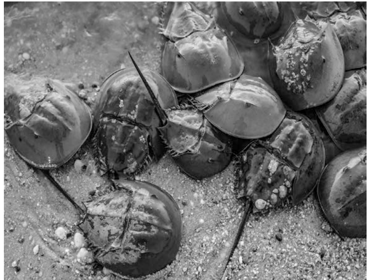
Horseshoe crabs during spawning along the shoreline.