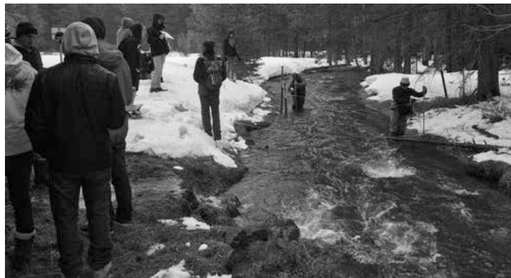
Students from the University of Nevada, Reno, learning how to measure streamflow at Sagehen Creek Field Station in California's Sierra Nevada during a small rain-on-snow event in March 2016.