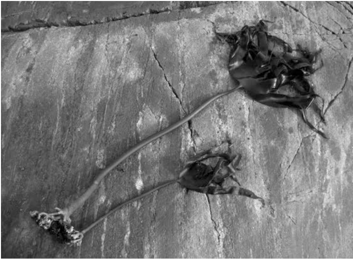
Two specimens of North Atlantic kelp, Laminaria hyperborea , show the anchoring holdfast at lower left, divided blades at upper right, and a stemlike stipe connecting the blade to the holdfast. In clear water, this species of macroalgae can grow to 100 ft (30 m).