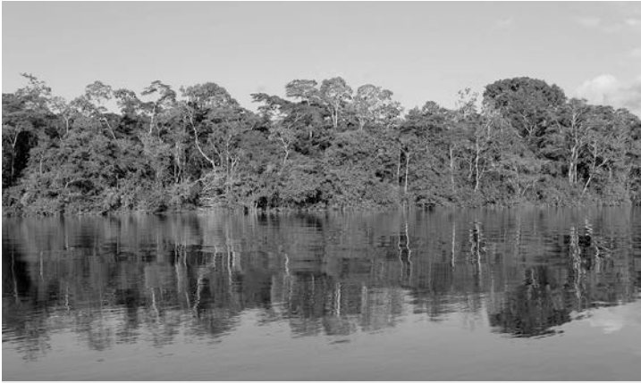
The Amazon rain forest in the state of Amazonas, Brazil.