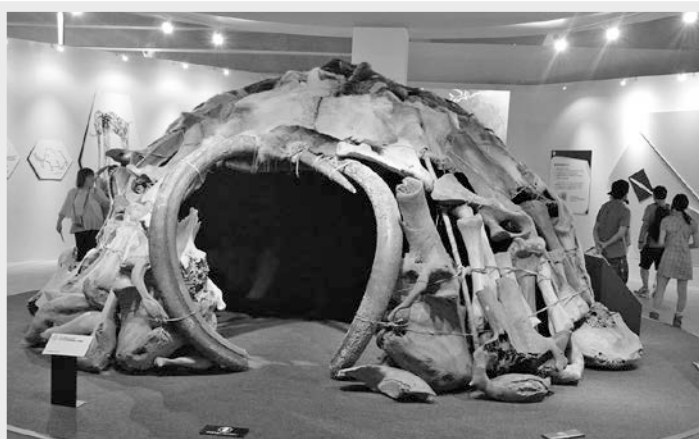
This museum replica of a prehistoric mammoth tusk and bone dwelling discovered in the Ukraine was created from actual mammoth fossils.

Credit: Georges Cuvier (1769–1832), via Wikimedia Commons