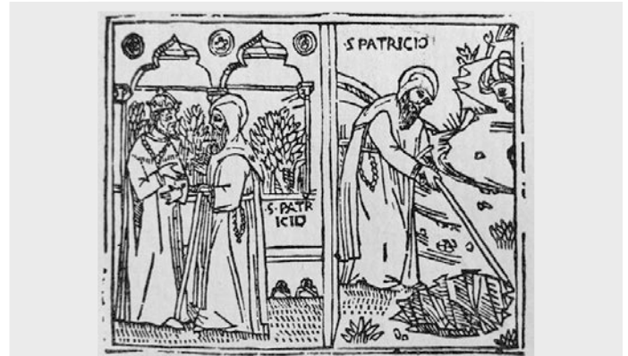
One of the many legends surrounding the life of Saint Patrick tells of his visions of purgatory.