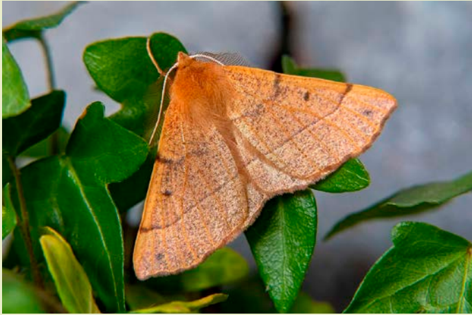
Feathered thorn moth ( Colotois pennaria ) on ivy in Tuntorp, Lysekil Municipality, Sweden.