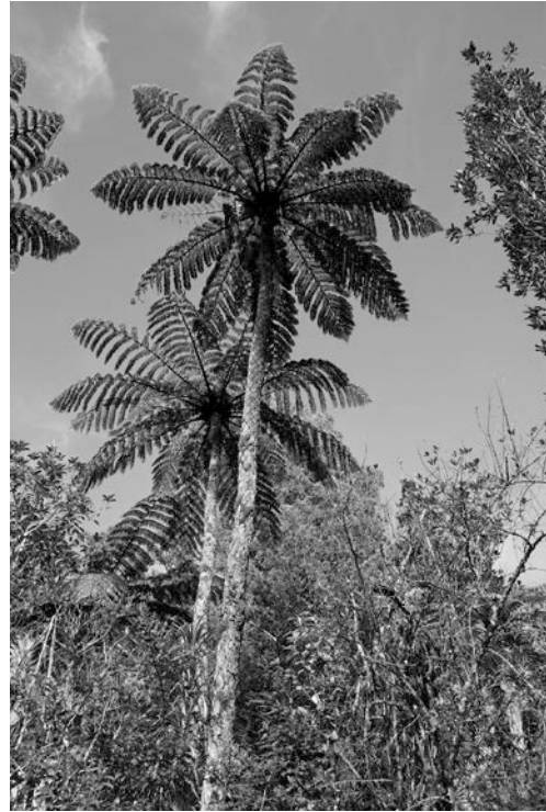
Tree ferns in the Waitākere Ranges, near Auckland, New Zealand.