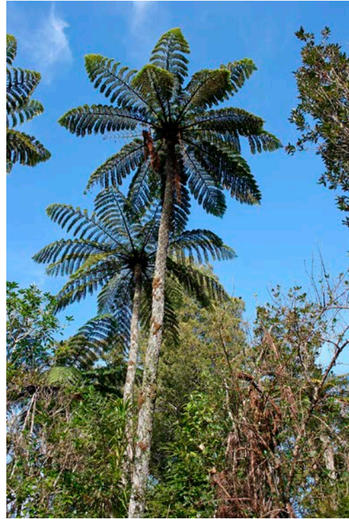
Tree ferns in the Waitākere Ranges, near Auckland, New Zealand.