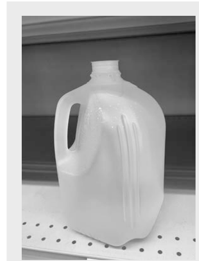
A one gallon water jug holds 3.78 liters of liquid.