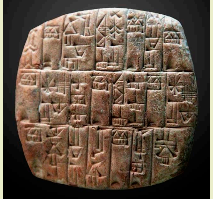
This Sumerian cuneiform tablet from around 1800 BC is like the one that first documented the use of potash in ancient Mesopotamia.