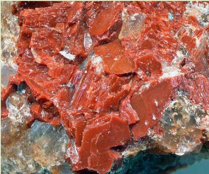
Mineral potash includes reddish sylvite (KCl) and greyish halite in a 1 in (2.6 cm) field of view.