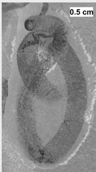
Silurian worm with external ring markings and a large sucker, probably a leech, from the 427-million-year-old Waukesha Biota Brandon Bridge Formation in Waukesha, WI; UWGM 2422.