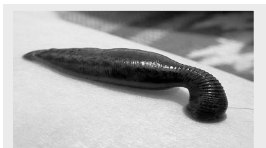
Medicinal leech ( Hirudo medicinalis ) attached to human skin.