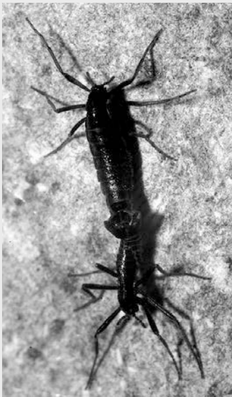
A larger female and smaller male of the species Belgica antarctica during mating. They only live 7 to 10 days as adults.