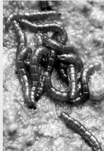
The larvae of Belgica antarctica , a flightless midge and Antarctica's only indigenous insect.