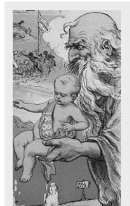
Father Time presents the New Year of 1886 in a political cartoon.