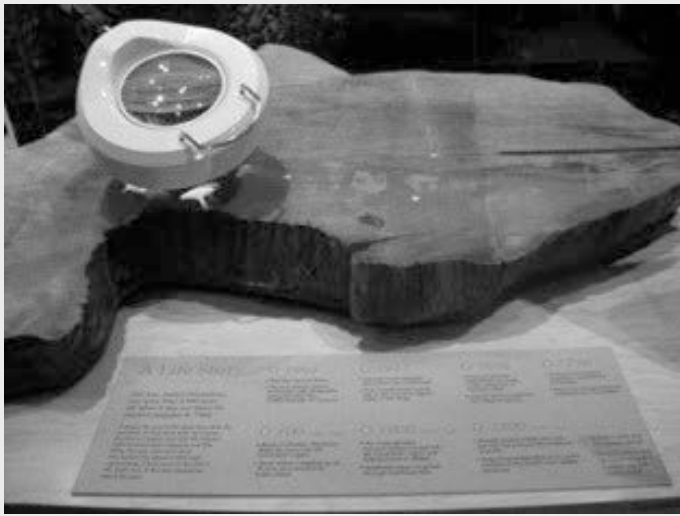
Prometheus slab at the Great Basin Visitors Center, Baker, Nevada.