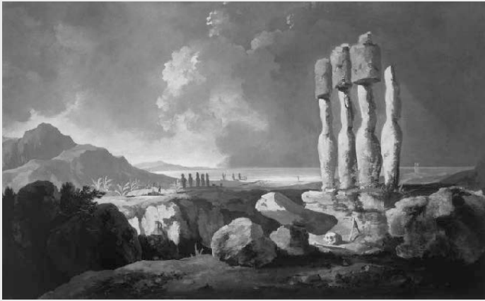
Moai on Easter Island, a painting by William Hodges, 1775–76.