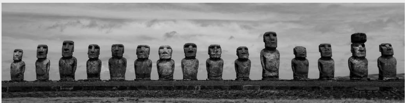
The fifteen standing moai of Ahu Tongariki, Easter Island.