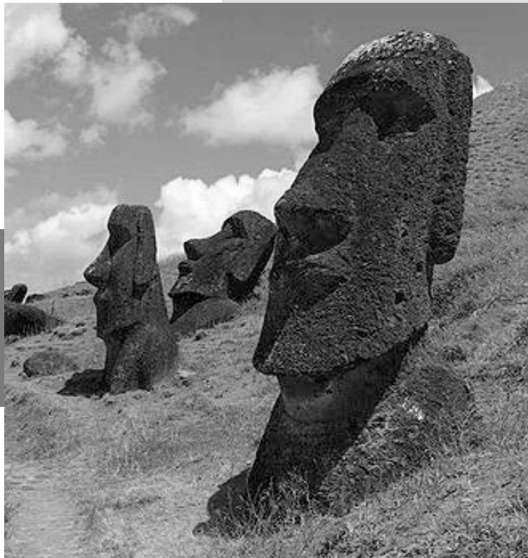
Moai at Rano Raraku on Rapa Nui (Easter Island).

This makes our Easter egg hunts look, well, like child's play.