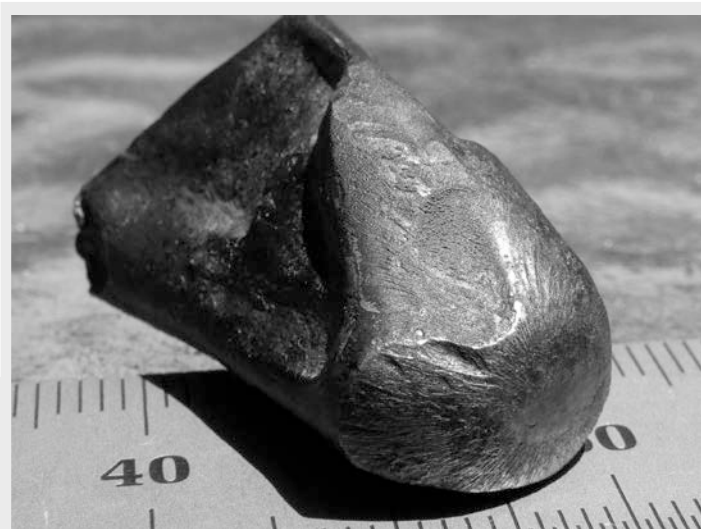
This is a flight-oriented specimen of an iron meteorite called NWA 859, or the Taza meteorite. It maintained a stable orientation of flight while traveling through the atmosphere. The specimen is about an inch (25 millimeters) long.