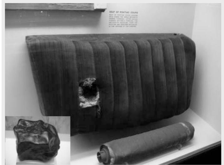
Photo of the car seat and muffler hit by the Benld meteorite with the 4.3 x 3.5 x 3.1 inches (110 x 90 x 80 millimeters) meteorite inset. The meteorite and portions of the car are now on display at the Field Museum of Natural History in Chicago.