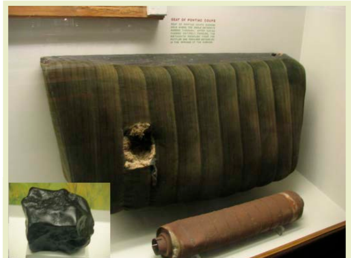
Photo of the car seat and muffler hit by the Benld meteorite with the 4.3 x 3.5 x 3.1 inches (110 x 90 x 80 millimeters) meteorite inset. The meteorite and portions of the car are now on display at the Field Museum of Natural History in Chicago.