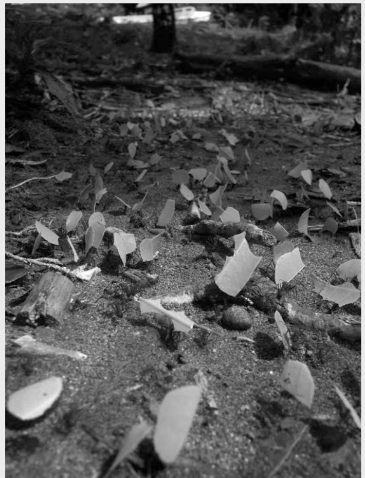
Leafcutter ants transporting leaves to their nest to feed their fungus farm.

Credit: Bandwagonman at English Wikipedia, via Wikimedia Commons