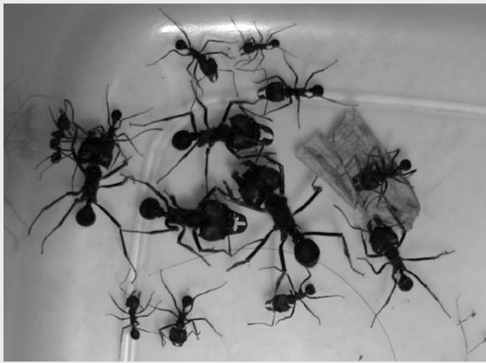
Different sizes of Atta insularis workers demonstrating the size variation of worker ants with different jobs in mature colonies.