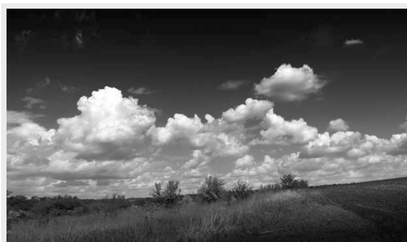
Flat-based cumulus clouds over a Ukrainian field in 2016.