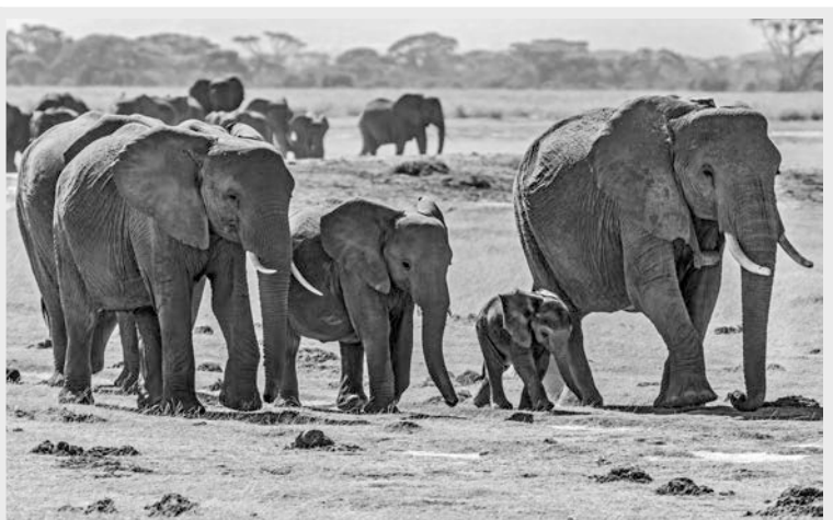
A group of African bush elephants in Amboseli National Park, south Kenya.