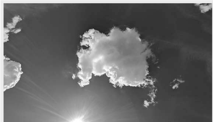
A puffy cumulus cloud in a bright blue sky.