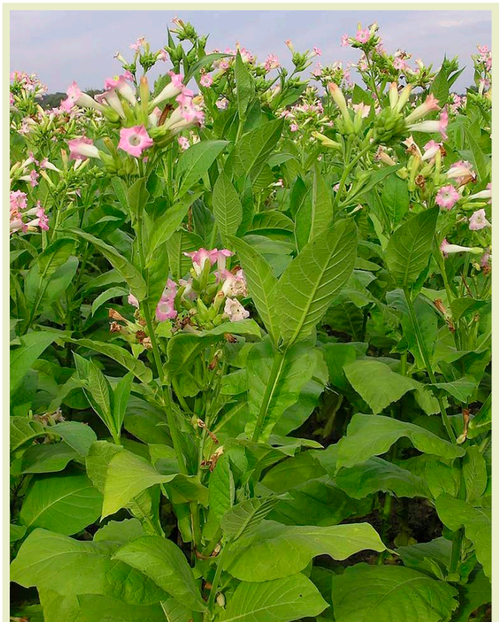
Tobacco Plant ( Nicotiana tabacum ) with flowers.