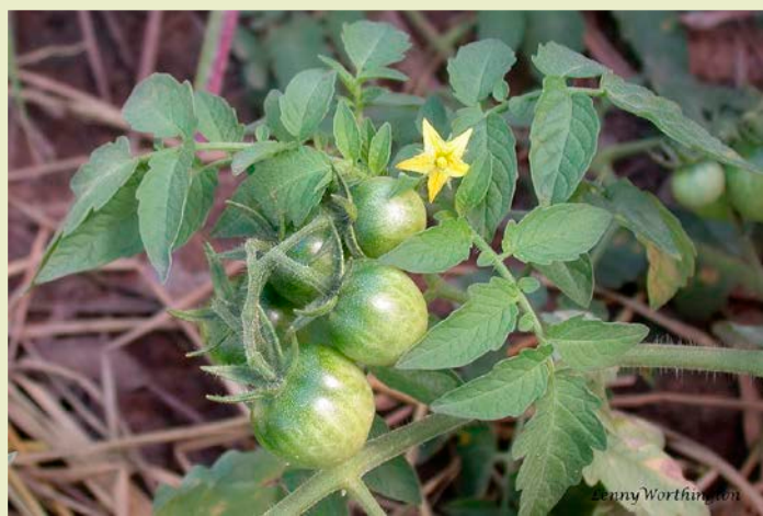
Tomato plant ( Solanum lycopersicum ) with flower and fruit.