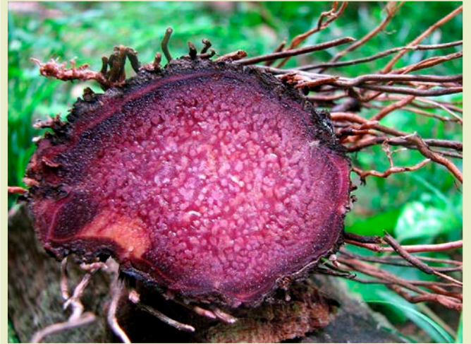
A recently harvested and sliced ube, a purple yam ( D. alata ), is native to Southeast Asia and used as an ingredient in desserts and ice creams.