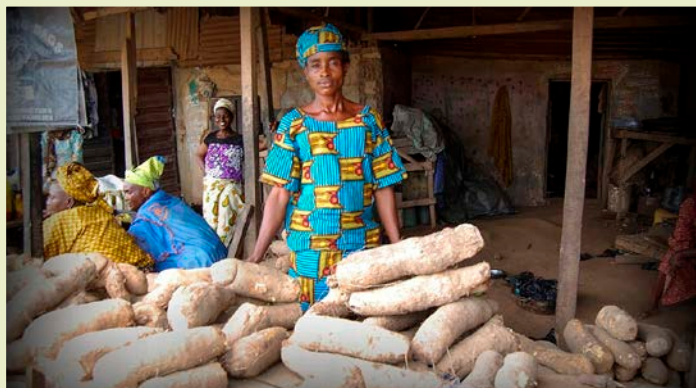
A woman selling yam tubers ( Dioscorea sp.) in Nigeria.