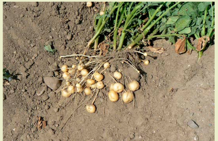
Potatoes ( S. tuberosum ) are stem tubers of a bush with more than 4,000 varieties.