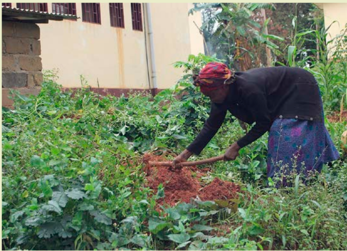
Harvesting yams ( Dioscorea sp.) in Cameroon. Yams come from the same family as lilies and grasses, and the tubers grow along modified stems that run underground.