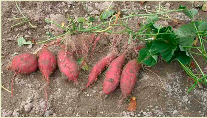
The root tuber of a sweet potato ( I. batatas ) plant, sometimes found in a purple Asian ice cream.