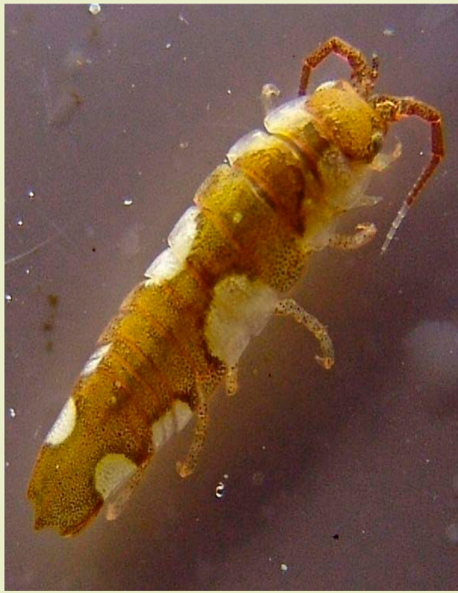
Top view of the isopod I. balthica from Greater Cumbrae, Scotland. These “bees of the seas” can grow as large as 1.6 in (4 cm).