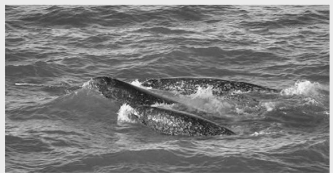
Blessing of narwhals, northern Canada, August 2005.