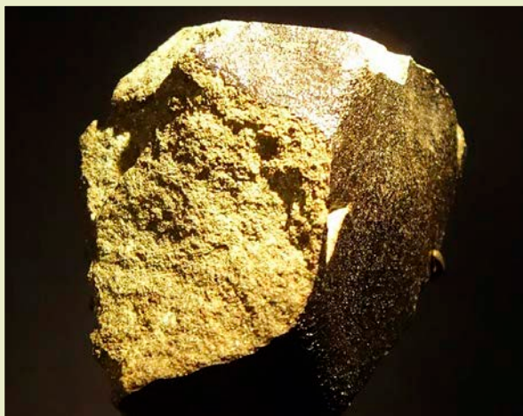
The original piece of the Nakhla meteorites which fell to Earth in 1911 near modern-day Abu Hummus, Egypt.