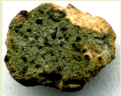
Another example of shergottite, NWA 2373, contains mostly olivine, pigeonite, and augite pyroxene along with the smaller amounts of glassy maskelynite.