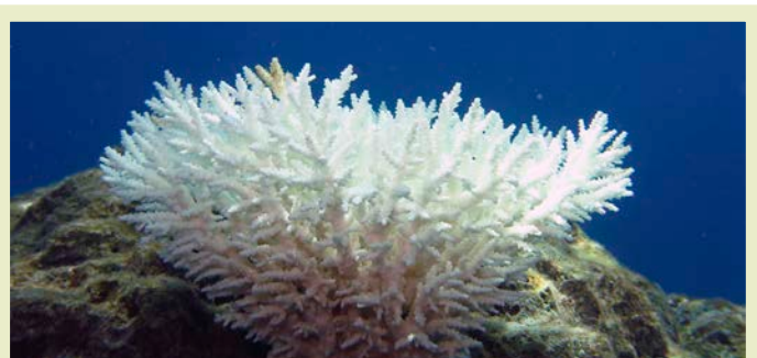
Bleached colony of Acropora coral in the Andaman Islands.