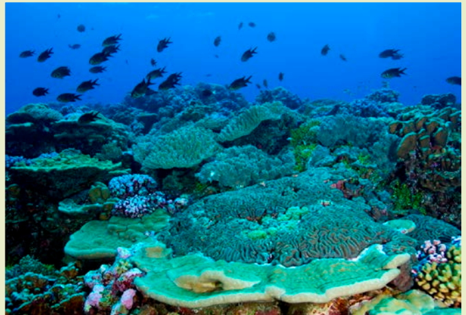
A healthy coral reef habitat on the remote Pacific atoll of Palmyra, halfway between Hawaii and American Samoa in the Pacific Remote Islands Marine National Monument.

Credit: Franklin Viola/Williams et al. (2013) , CC BY 3.0, via PeerJ Life & Environment