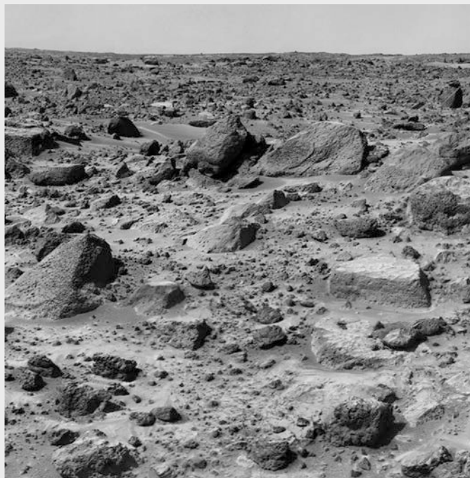
Could this rocky Mars landscape one day become lush and green like the forest floor in Olympic National Park?