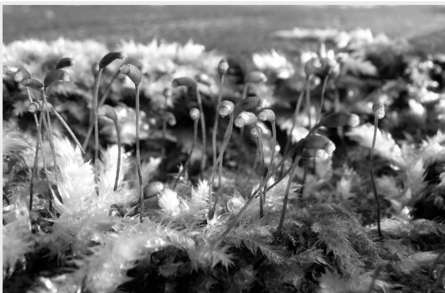
Sporophytes (spore-dispersing individuals) of a moss.