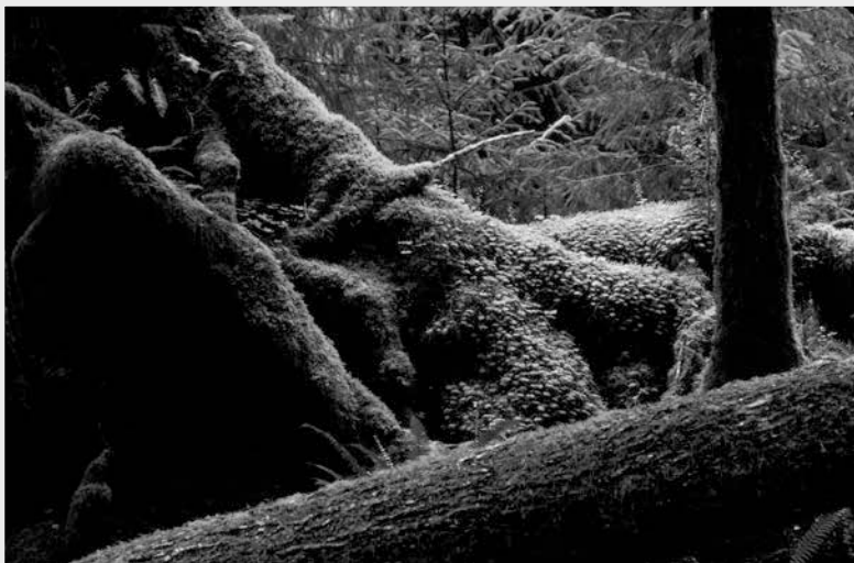
The dense, green landscape in Olympic National Park, Washington.